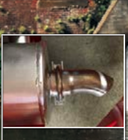
Spark arrestor standard on all models, units approved for use on US Forest Service lands