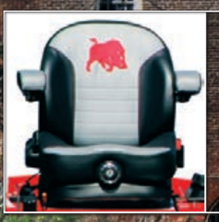
Deluxe Seat (standard on the HDC/HDZ series and optional on the HDE series)